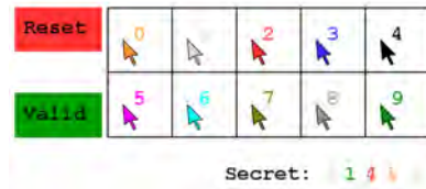
Figure 3: The Color PIN system using a 2 \times 5 color layout. The digits are colored with the corresponding matching cursor color.

we should ideally change the UI password after at each session. This can be done by using a OTP token device for generating UI password keys. The user then keeps his/her secret password and generate a UI password when logging. The advantage of the color PIN system over the traditional OTP token device is that even if the physical token is stolen then it does not allow to properly log in as the ID password is not compromised.