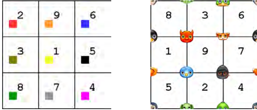
Figure 4: Snapshots of the login system using different rendering styles for the moveable cursor board: (left) color boxes and (right) icons.

1234 is entered using C and D cursors aligned to keys 1 and 2, respectively (or using LIGHTGRAY and RED color cursors). Note that by doing so, we weaken the security as we have n^k potential combinations instead of n^{2k} in a login session. In general, we can create a secure password including the UI password by juxtaposing the two parts: \boxed{\text{ID PIN}} + \boxed{\text{UI PIN}} . The UI PIN may be shorter than the PIN. For example, we can use letter 'A' cursor to enter the full PIN. When the UI PIN is shorter than the ID PIN (e.g., 1234AB), we choose the current cursor using the modulo operator (here, '1' and '3' should be entered using 'A' and '3' and '4' using 'B').