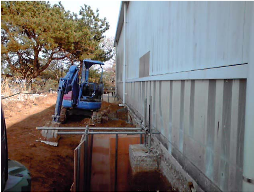
Accident site near the empty container warehouse (1)