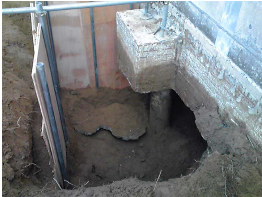
Accident site near the empty container warehouse (2)