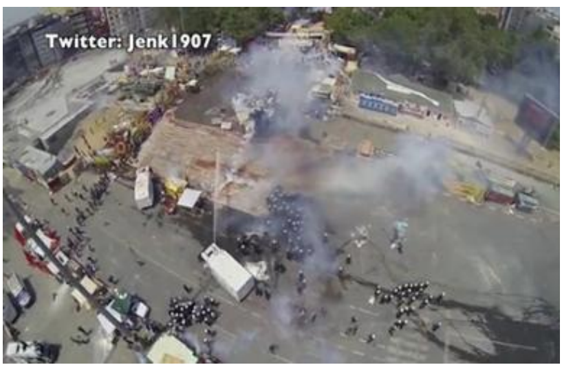
Drone vision over Taksim Square, Istanbul, Turkey - June 2013

Elsewhere in the Middle East attitudes evolved rapidly. In June 2013 in Turkey, protestors in Istanbul's Taksim Square launched a small multi-rotor, a A$750 DJI Phantom equipped with a A$300 Go Pro camera, to illustrate the confrontation with police, with the vision broadcast by CNN International. Confirming Cox's observation on the vulnerability of the technology, the drone was ultimately shot down by police, but another craft soon appeared to take its place – an example of the 'disposable drone' concept where there was an accepted risk the craft may be seized or destroyed - then easily replaced by another small, simple, cheap but effective UAV. A decade ago this type of aerial filming capability would have required a much larger craft that according to aerospace engineers, would have cost more than A $100,000, many times the size of a Phantom with an operating complexity beyond the expertise of most journalists and activists (author presentation to the Drone Power Conference, Canberra, July 2013).