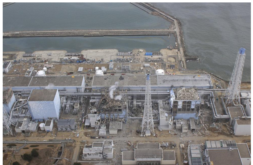
This March 20, 2011 image taken by the Air Photo Service UAV shows a wide shot of the crippled Fukushima Daiichi nuclear power plant, from left; Unit 1 (partially seen), Unit 2, Unit 3 and Unit 4.

A radiation expert was on standby for decontamination after each mission, but APS Chief Executive Yamazaki claimed there was no detectable contamination, despite the craft's multiple low-level passes just 300 metres above the damaged reactors. The APS drone was not fully autonomous and the missions had to be pre-planned with calculations of direction, route and airspeed programmed into the drone prior to launch. Once airborne, progress of the craft was monitored via computer. The operators were unable to directly control the camera or transmit images from the craft back to the control point in real-time. All 600 images were sent to TEPCO, but only 10 were approved for public release.