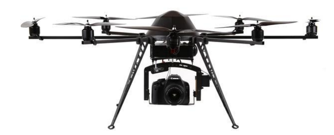
A$20,000 MikroKopter OktoKopter XL ARF

Larger multi-rotor, 2-7kg, capable of lifting heavier, broadcast quality HD live streaming cameras. Typically an operating radius of about 2,000m, with 'line of sight', maximum operating height of 2,000m, maximum speed 70 km per hour. Endurance 12-20 minutes. Requires skilled UAV pilot, usually supported by a camera/systems operator. Majority of drone journalism in urban areas will initially use this type. A$2,000 - $20,000 depending on complexity.