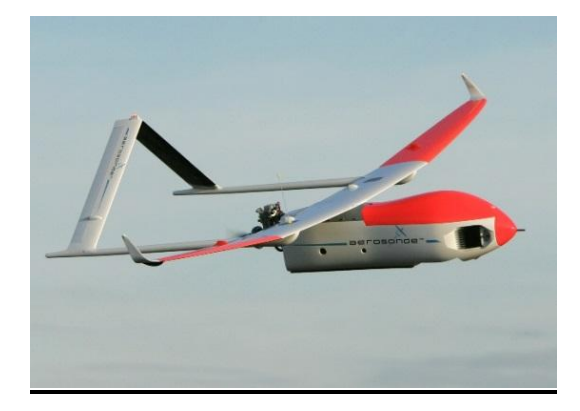
Aerosonde Mark 4.7