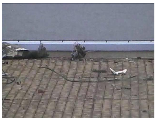
A T-Hawk (centre of picture) lies on its side after 'crash landing' on the roof of Fukushima Reactor No.2 Image source: Japan News Today.

On June 24, a T-Hawk lost control while collecting dust samples around the complex and was forced to make 'an emergency landing' on the roof of the No.2 reactor. Japanese and western media reported that the 'landing' appeared to be a crash. Due to the small size and weight of the craft, TEPCO stated that it was unlikely that the drone had pierced the damaged reactor roof, and announced that the drone would be recovered by a long crane (HeraldSun 2011; Inajima 2011). Flight restrictions caused by high wind and rain, and the accident underscored the limitations of current small UAV technology. Despite this mishap, Japanese and US sources indicated that the drone operations provided valuable visual data for emergency coordinators (Madrigal 2011; Pasztor 2011).