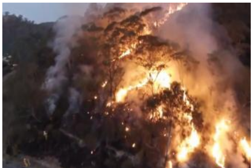
Drone vision of the NSW Blue Mountains bushfires. October 2013

In October 2013, an anonymous drone operator Cividrones , posted a YouTube video of the aftermath of the Blue Mountains bushfires that had caused widespread destruction in NSW (Youtube 2013). The video clip, which appeared to have been recorded from a small multi-