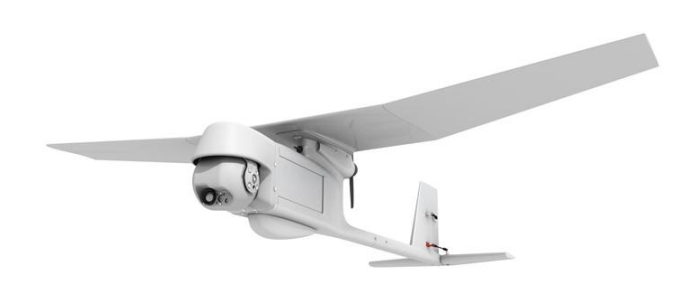
Raven RQ-11B with gimbal-mounted camera. In service with the US military. Approx.US$35,000 each.