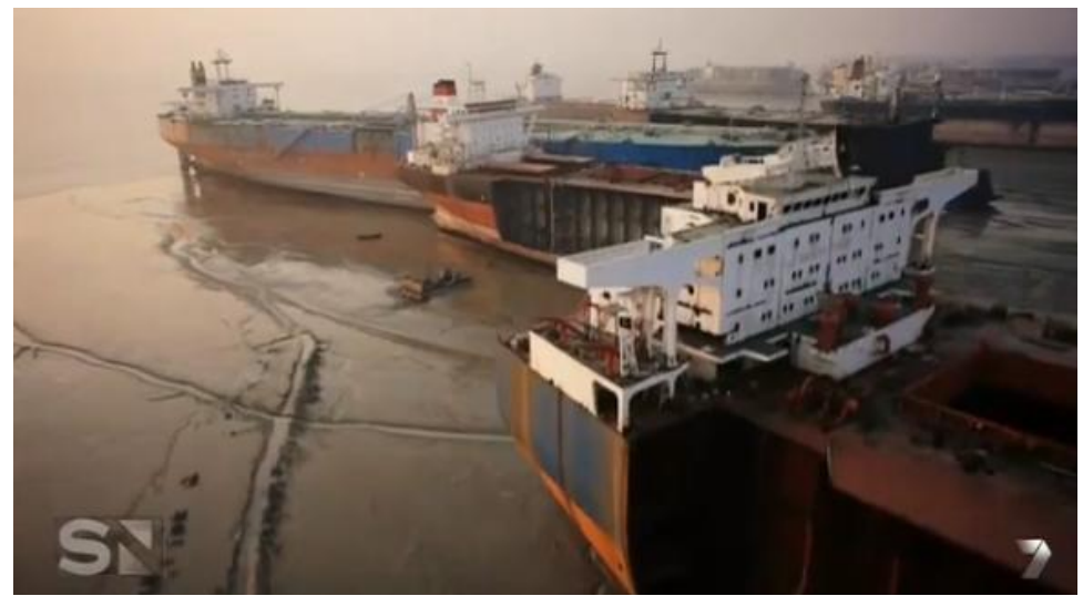
'Graveyard for Giants' - screenshot.

The BBC and CNN also launched UAVs on international news and current affairs assignments, while Australian commercial TV Networks Seven and Nine, facing restrictions domestically also began deploying small drones overseas. A Seven Network video journalist won the 2013 Walkley Award for Camerawork for a series of reports that included compelling drone imagery of the perils of the beach ship-breaking industry in Bangladesh, sequences that would have been extremely difficult, and possibly dangerous, to obtain by conventional filming methods (Russell 2013).