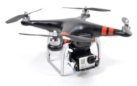
DJI Phantom with Go-Pro

1. <u>Small</u>, helicopter-like 'multi-rotors' weighing less than 2kg, on-board Wi-Ficontrolled by smart phone or tablet device. Cheap A$700-$1,500. Easy to operate with a range of a few hundred metres. "Go Pro' standard camera quality. Suitable as a 'back pack' option where immediacy takes precedence over picture quality.