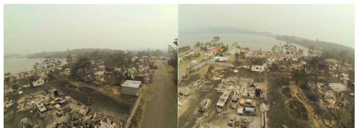
Drone Images of the Dunalley bushfire devastation – broadcast by ABC TV News January 2013.

Current CASA regulations were obeyed, as Taylor operated as a hobbyist and recorded the vision for the sole purpose of posting on his YouTube page. ABC news producers offered no payment or reward, when requesting permission to broadcast the online material (Taylor 2013). The vision was broadcast, only after ABC editorial staff were satisfied that the images were authentic, had been recorded under ethical circumstances and that Taylor had not broken any laws. The ABC had recently introduced editorial guidelines for the use of smart phone camera vision/stills offered for broadcast by members of the public. These regulations on 'user generated content' could be easily adapted to incorporate amateur 'drone vision' contributions.