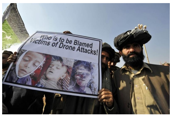
Pakistanis protesting against US drone strikes.

Reporting on military activity from an 'embed' is only one element of news-gathering in conflict. An equally important component is the impact of the conflict on the civil population; investigating and reporting on issues including aid distribution, medical treatment, refugee welfare and allegations of human rights abuses. Such assignments require the journalist or news-gathering team to display a high degree of sensitivity and tact. There is a high risk that a media drone flight may be mistaken for military activity (author interviews with Cox & Swinsburg), particularly on assignments in Afghanistan and the tribal areas of Pakistan where there is already a high level of military drone activity resulting in extensive civilian casualties.