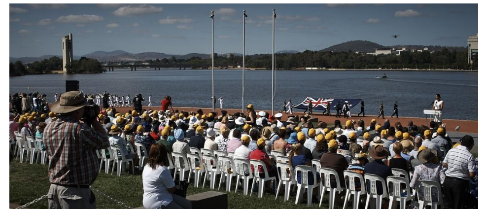
Eye in the sky: the ABC/Coptercam UAV can be seen above/to the right of the police boat on Canberra's Lake Burley Griffin.