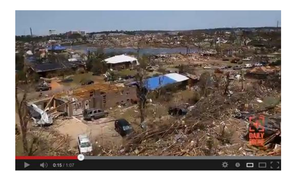
Screenshot of a "Daily Drone" video report of tornado damage in Tuscaloosa, Alabama. The imagery was recorded from a MicroDrone .