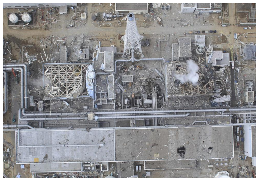
March 20, 2011, Damaged Unit 4 (left) and damaged unit 3 (right) from the Air Photo Service UAV.