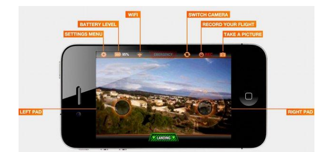
Parrot AR Drone – Smart phone control panel – including live video feed.