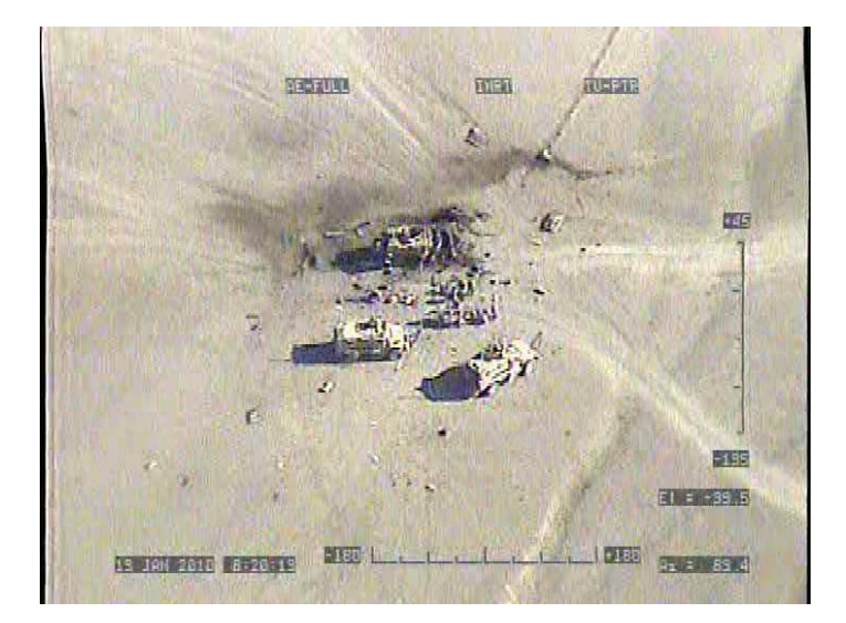
Drone vision – Shadow UAV live vision of the destroyed MRAP armoured vehicle in which two US soldiers were killed and three wounded.