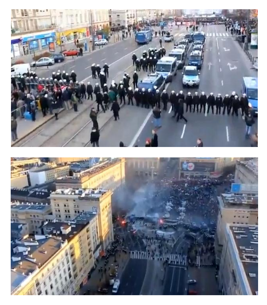
Drone Over Warsaw – November 2011. Demonstrating the suitability of small multi-rotor drones for news gathering in confined urban environments.

Another early demonstration of the technology occurred in Warsaw Poland in November 2011 when an anonymous activist launched Robokopter a small multi-rotor to record rioting, then uploaded the vision to YouTube (Anon 2011a, 2011b). The videos illustrated the capability of a small drone in easily circumventing police barricades blocking media access to the centre of a protest.