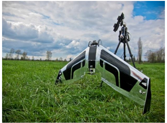
TBS Ritewing Zephyr II A$2,000, range 30-45km

3. <u>Small fixed wing craft. R</u>esembles large model aircraft. Hand launched. Various types have 45-90 minutes endurance with a range of 10-45 kilometres. Can be operated beyond visual 'line of sight' of the operator. Requires set up of antenna for ground control station. Suitable for longer range regional or coastal assignments. A$2,000-$50,000, depending on complexity.