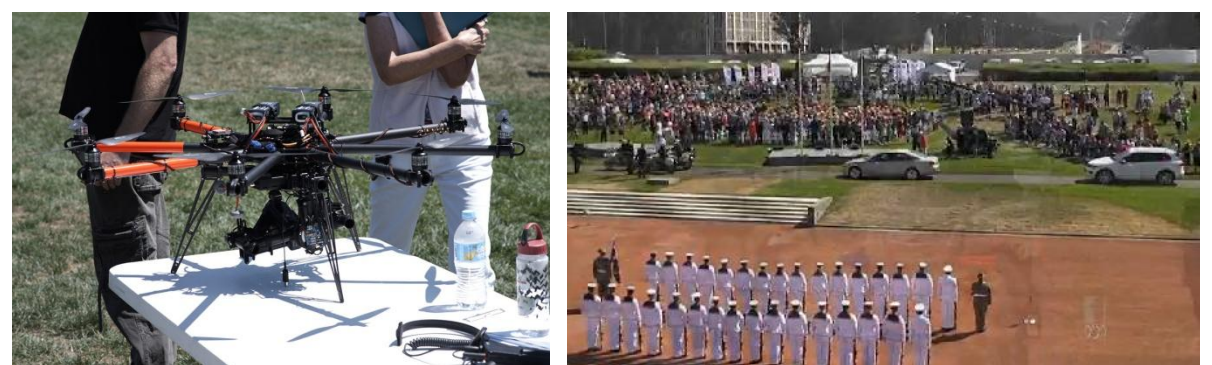
Australia Day 2014: (L) The custom-built 8 rotor UAV operated by 'Coptercam' for ABC-TV and (R) a screenshot from the live broadcast

"Whilst a lot of what we wanted could have been achieved by a helicopter the noise and visual impact would have been completely unacceptable for the program – let alone the cost... The result was an exponential leap in the look and visual impact for the program. A UAV was the only option for the shots we wanted. Prior to the availability of UAV's with live broadcast quality links, we could only dream of getting these shots". (Waite 2014).