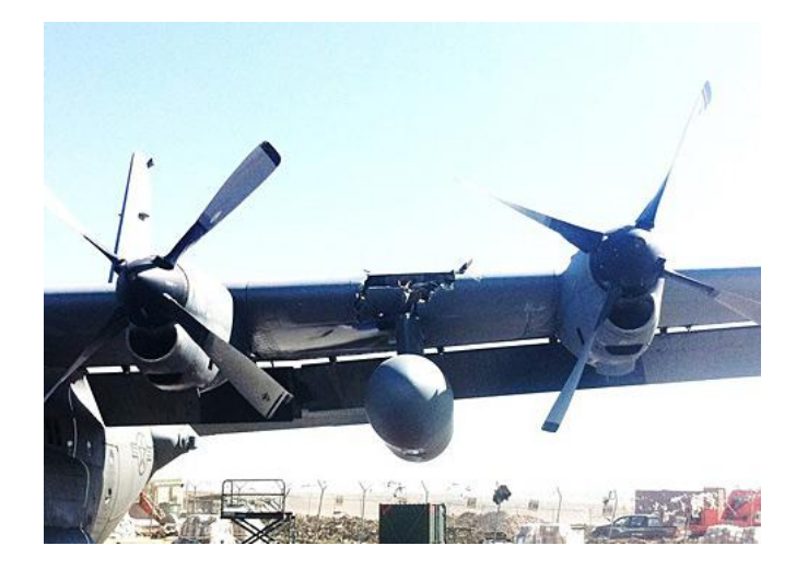
The damaged C-130 following mid-air collision with RQ-7 Shadow drone over Afghanistan.

In 2013, no commercially available anti-collision technology was readily available for small UAVs. 'Detect and Avoid' anti-collision transponders are now fitted to piloted aircraft, but developers still faced challenges in attempting to miniaturise the systems for UAVs. The US Government Accountability Office, after examining the progress of the FAA's integration of Unmanned Aerial Systems (UAS) into the domestic airspace, made a sombre assessment' (Goldberg, Corcoran & Picard 2013). In submission, the GAO's Gerald Dillingham told a Congressional panel that: