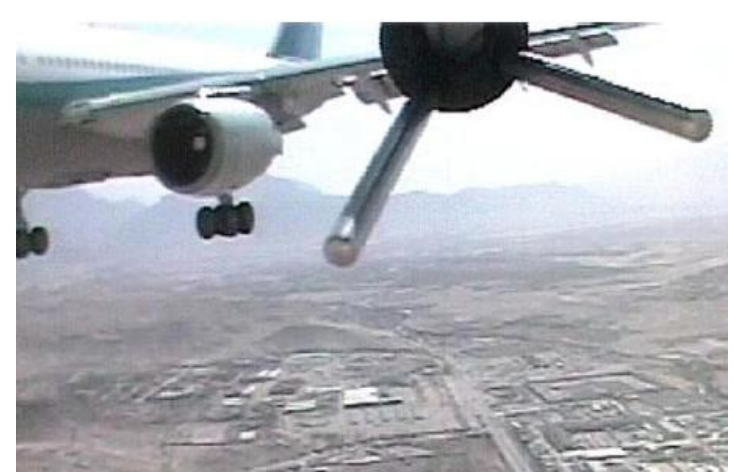
Screenshot: A German Army UAV records a near miss with an airliner over Kabul, Afghanistan, 30<sup>th</sup> August 2004.

This concern was first realised in dramatic circumstances on 30<sup>th</sup> August 2004, when an Afghan-operated Airbus with 100 people on board, on approach to Kabul Airport, passed within 170 feet (51 metres) of a German Army Luna tactical UAV, with the near-miss recorded by the drone's camera.