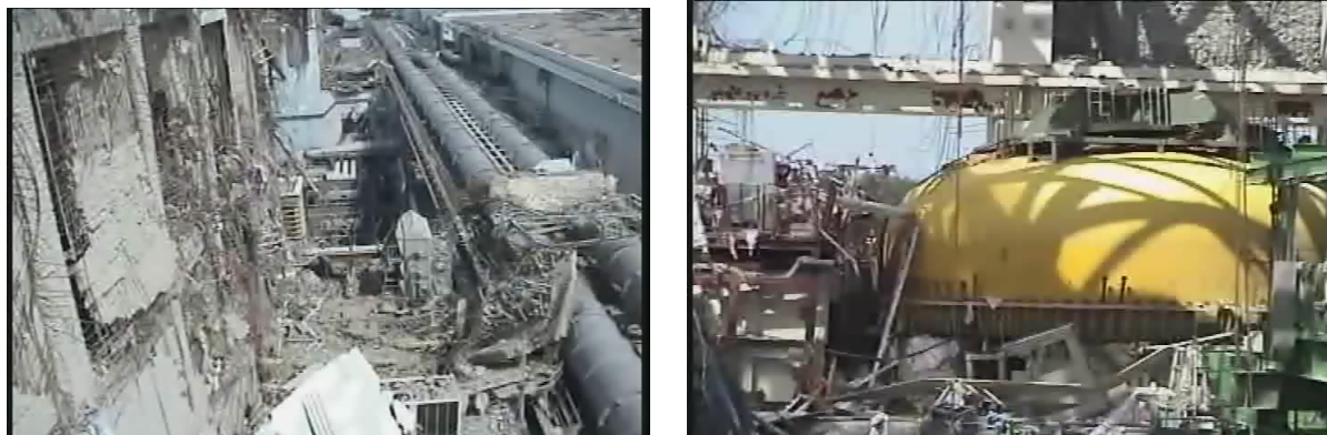
T-Hawk image -seashore-side of the reactor building.