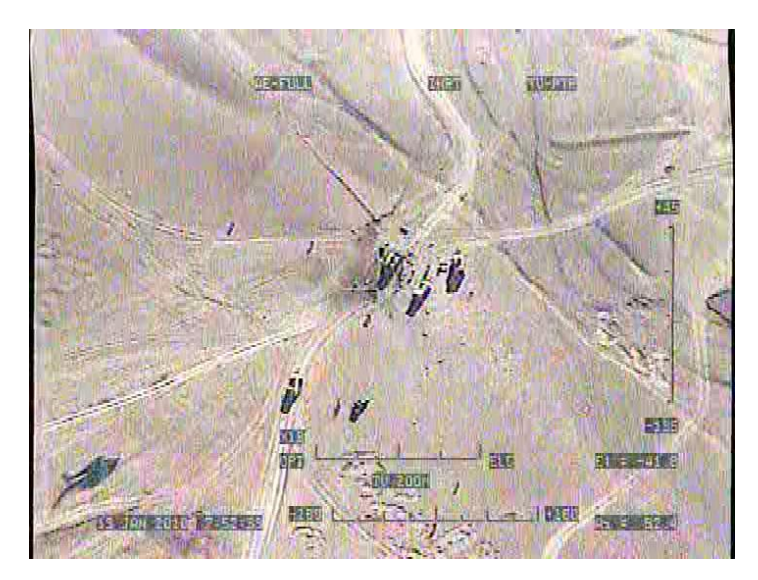
Drone vision – The scene as recorded by the Shadow UAV overhead. In this screenshot casualties are being extracted from vehicle wreckage. The lead 'camera' helicopter on the mission is bottom left of frame.