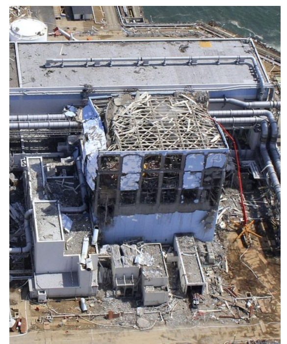
March 24, 2011. The Air Photo Service UAV image shows the damaged Unit 4 of the crippled Fukushima Daiichi nuclear plant.

By the fourth week of the crisis, TEPCO required closer examination of the damage than the APS UAV could provide, so a different UAV type, the US Honeywell T-Hawk , was called into service. Dubbed 'the flying beer keg', the T-Hawk has a 'hover and stare' capability, enabling extremely close access to the target for on-board cameras (Honeywell 2013; Madrigal 2011). T-Hawk had been extensively deployed by US forces in Iraq searching for roadside bombs (ArmyTechnology 2012). Four T-Hawks were sent to Fukushima, two flying operationally, and two held in reserve. The drones were operated by an American civilian crew wearing full-body radiation protective gear. TEPCO restricted information on the exact nature of the missions. However the civilian Honeywell crew told the Wall Street Journal that the T Hawks were unaffected by radiation, but that rain and heavy winds prevented the drones from getting airborne on some days (Pasztor 2011).