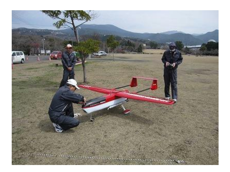
The Air Photo Service team prepare the APS UAV for the second mission over the crippled Fukushima Dai-ichi nuclear plant on March 24, 2011.

Immediately following the earthquake and subsequent tsunami, the US Government authorised 20 missions by US Air Force Global Hawk , over the damaged Fukushima Daiichi nuclear plant (UASvision 2011b). The US$200M Global Hawk was the largest, most sophisticated UAV in operational service, capable of cross the world on non-stop 35 hour missions. Global Hawk primarily a high altitude military intelligence, surveillance and reconnaissance platform, and TEPCO urgently needed a closer inspection, so smaller UAVs were soon dispatched to the site. First to be launched was a small fixed wing UAV, operated by Air Photo Service (APS), a private commercial aerial photography venture (AirPhotoService 2012).