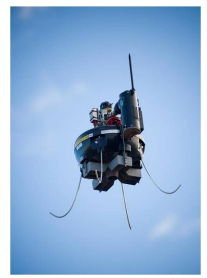
Honeywell T-Hawk Unmanned Aerial Vehicle

By the fourth week of the crisis, TEPCO required closer examination of the damage than the APS UAV could provide, so a different UAV type, the US Honeywell T-Hawk , was called into service. Dubbed 'the flying beer keg', the T-Hawk has a 'hover and stare' capability, enabling extremely close access to the target for on-board cameras (Honeywell 2013; Madrigal 2011). T-Hawk had been extensively deployed by US forces in Iraq searching for roadside bombs (ArmyTechnology 2012). Four T-Hawks were sent to Fukushima, two flying operationally, and two held in reserve. The drones were operated by an American civilian crew wearing full-body radiation protective gear. TEPCO restricted information on the exact nature of the missions. However the civilian Honeywell crew told the Wall Street Journal that the T Hawks were unaffected by radiation, but that rain and heavy winds prevented the drones from getting airborne on some days (Pasztor 2011).