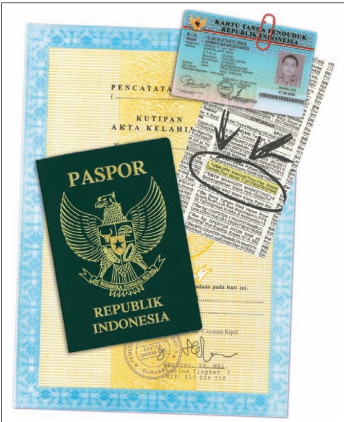
Operation Triple X—An Indonesian Passport, an Identification Card, and the Marketing of Fraudulent Documents.

of the J.W. Marriott Hotel in Jakarta that killed at least 12. In 2003, JI was behind a potentially devastating plot to bomb U.S. diplomatic facilities in Singapore and U.S. military bases in the South Pacific. Additionally, the U.S. Embassy in Jakarta and the U.S. Consulate General in Surabaya were closed several times in 2005 and 2006 because of similar terrorist activities. The investigation yielded 84 arrests and over 4,800 fraudulent documents, including Indonesian passports, U.S. passports and visas, Indonesian national identification cards, marriage, birth, and family records, vehicle registrations, and drivers' licenses. More than 8,000 individuals were identified as having engaged the services of these criminal syndicates for the purpose of getting into the United States. The potential for serious violence became clear when one of the syndicate's clients was arrested for attempting to smuggle automatic weapons from Indonesia into Los Angeles.