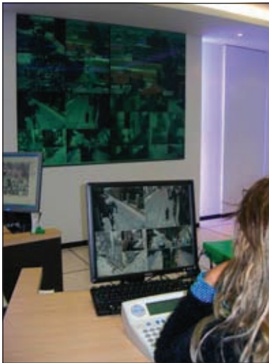
Colombian Counterterrorism Analyst at Her Work Station.