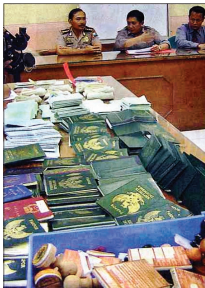
Operation Triple X— Indonesian Officers with Masses of Confiscated Fraudulent Documents.

rected through criminal investigation . 411 DSS followed national security and State Department policy by not classifying information—case information is available to all who have a legitimate interest—including foreign law enforcement. 412 If DSS had classified this information, important leads would have been suppressed and unavailable to those who would find it useful.