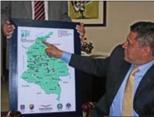
Colombian Official Pointing to GAULA Operating Areas.

in a police force reinforces public confidence and serves to combat crime—a parasitic influence on any country. Because international police networks, especially informal police networks, empower police by improving efficiency, international police networks can empower weaker states. Because it is often in the interest of weaker states to tolerate intergovernmental networks, it is also in their best interests to tolerate autonomy from their police—because it ultimately benefits the state. This is why police entities are often formidable adversaries of intelligence services; 414 it is also why police networks are ideally suited to deal with another formidable network, the networks of Islamist terrorism and insurgency.