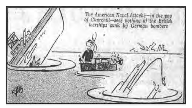
Figure 3. German Propaganda on Kirk's Visit.

While British reluctance to share intelligence once war broke out in September 1939 can be attributed to the factors cited above, there were more mundane problems that militated against the exchange of information in the first few months of the war. Kirk reported that factors such as logistics, lack of social opportunities. and the movement of some Admiralty offices during the