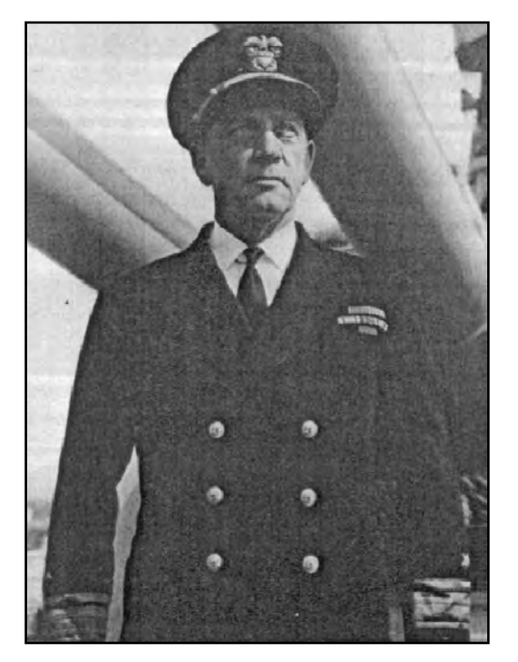
Figure 1. RADM Kirk

The U.S. Naval Attaché during this period, Captain Alan Goodrich Kirk (later RADM Kirk) was