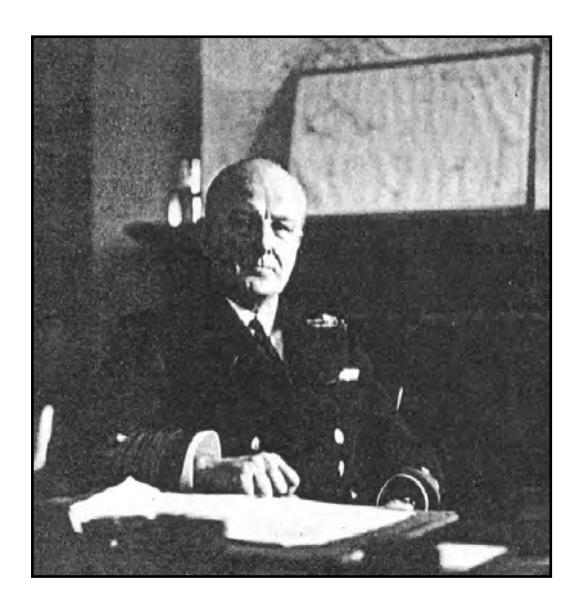
Figure 2. RADM Godfrey

Kirk's performance as attaché has been misrepresented by authors who contend that he was unrealistically pessimistic about England's chances of surviving the war.