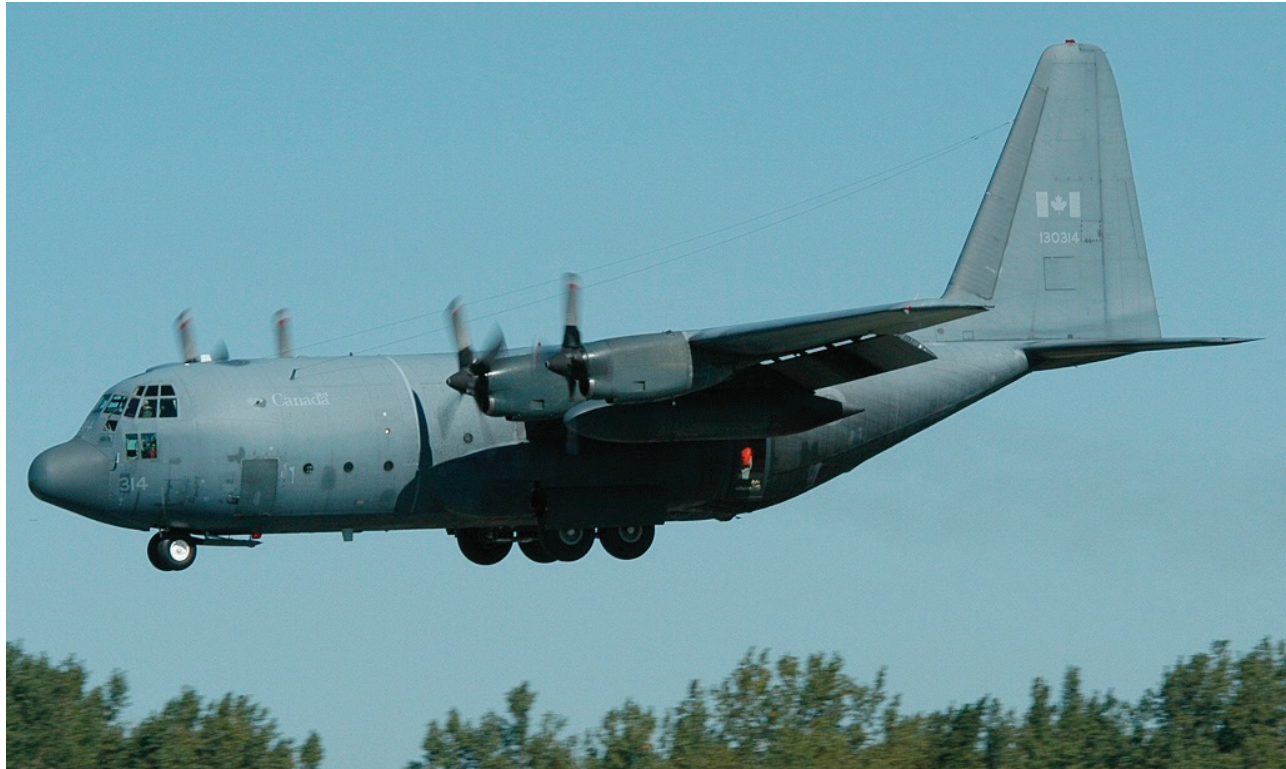
CC-130E Hercules Employed for Search and Rescue in Canada Are Nearly Half a Century Old

Norway does indeed operate F-16s, and roughly half of that country is north of the Arctic Circle. However, Norway's Arctic is considerably smaller than Canada's and much more temperate — thanks to the effect of the Gulf Stream. Additionally, Norway has much better infrastructure than Canada in its Arctic, including numerous paved runways as far north as 78 degrees, at Longyearbyen on the Svalbard Archipelago. Crucially, Norway also has excellent search and rescue, including long-range search-and-rescue helicopters positioned in its Arctic, including on Svalbard.