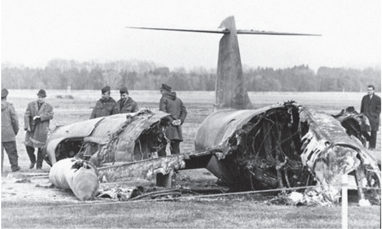
An All-Too Familiar Scene in the 1960s, 70s and 80s: A Crashed F-104 Starfighter

North”. 16 The next month, The Globe and Mail again reported that the F-18 “is preferred by Canadian Forces pilots on the ground that for long Arctic patrols two engines would be better than one.” 17