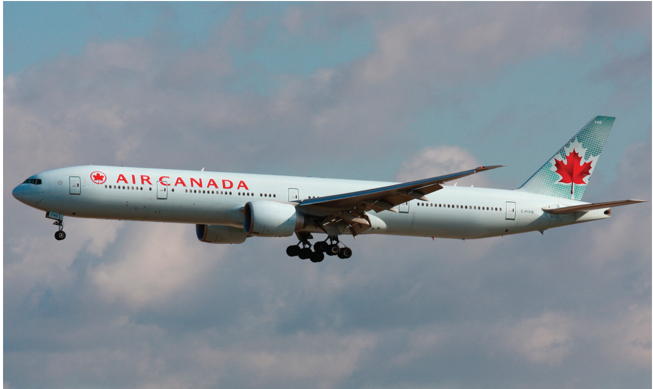
Boeing 777: One of the Safest Aircraft in the World

location, the plane was able to land safely at Anadyr, Russia, 550 kilometres away. 50