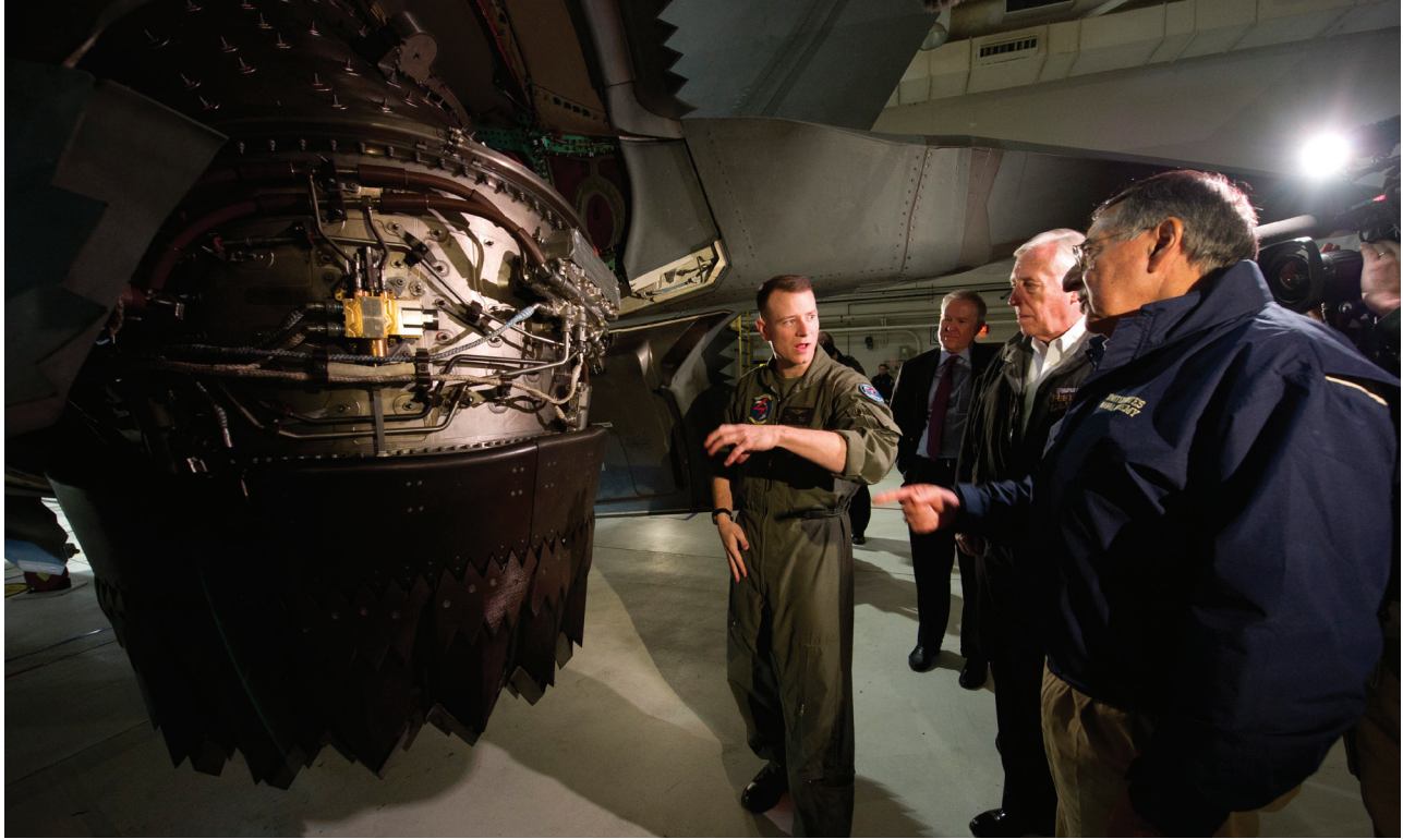
F-35's Single Engine Driven by US Marines' Need for Short Take-off and Vertical Landing

Hostage, the head of Air Combat Command, told the Air Force Times : “The F-35 is not built as an air superiority platform. It needs the F-22.” 39