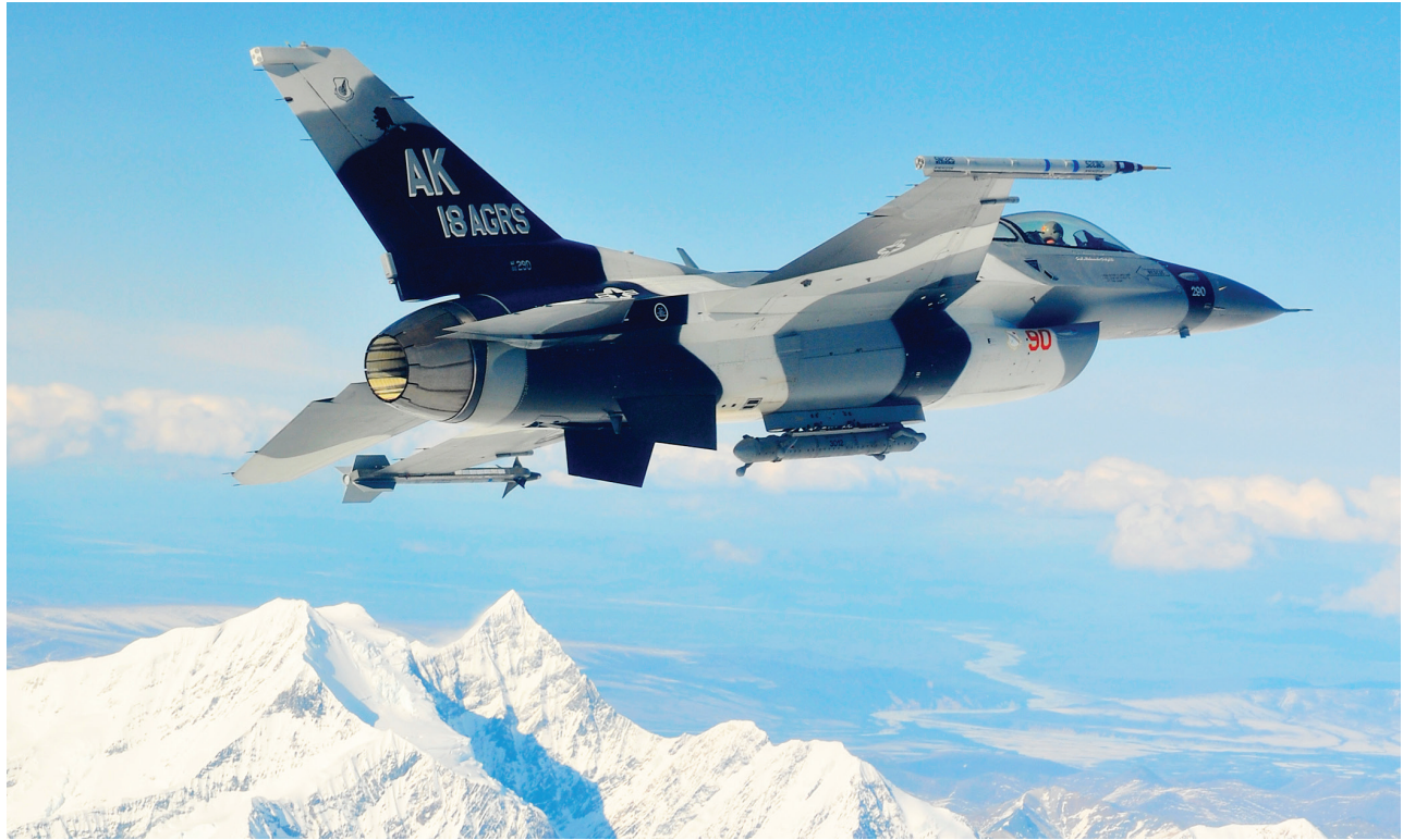
Single-Engine F-16 ‘Lawn Dart’

crashes is limited, at least 76 and potentially as many as 166 were caused by engine failure. 23 The Norwegian Air Force has lost 16 of its fleet of 72 F-16s to crashes. At least six of the crashes involved engine failures, three of which were caused by bird strikes. 24