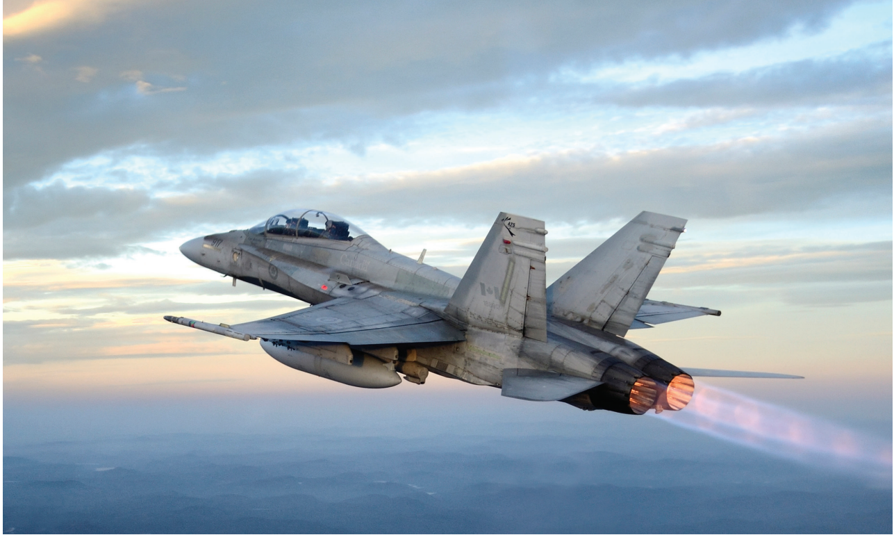
Twin-Engine CF-18 Hornet

a flame-out while on patrol with the F-18, at least you can be sure of getting home on the other engine.” 20 Manson was clear that Canada would have lost more aircraft to accidents had it chosen a single-engine plane: