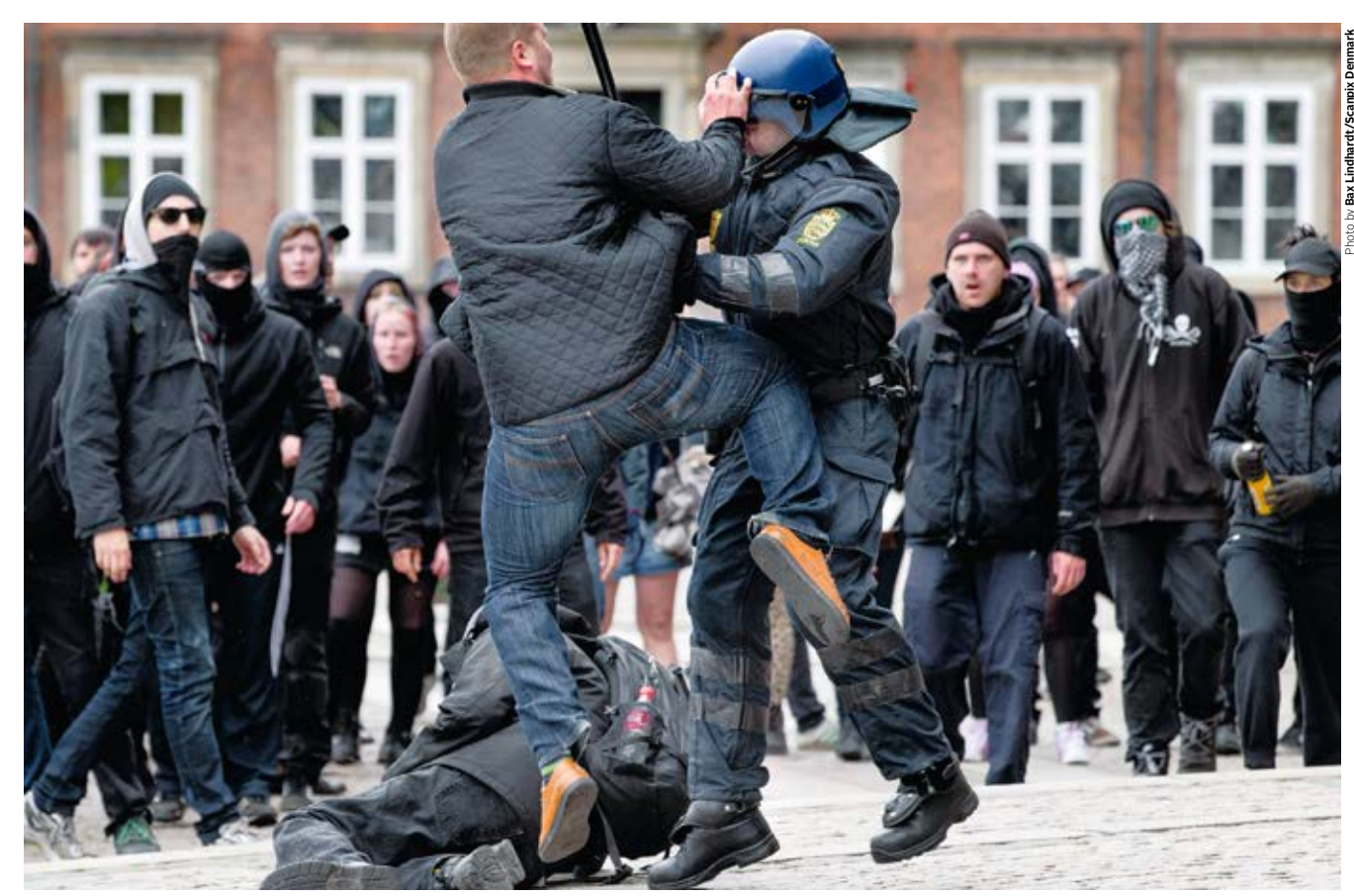
Flash point: Supporters of neo-Nazi party the National Socialist Movement of Denmark clash with left-wing protesters at a Racism Free City demo in Christiansborg Palace Square, Copenhagen, on May 10. Police made several arrests

The Norwegian Progress Party held its general meeting in Gardermoen in 2007