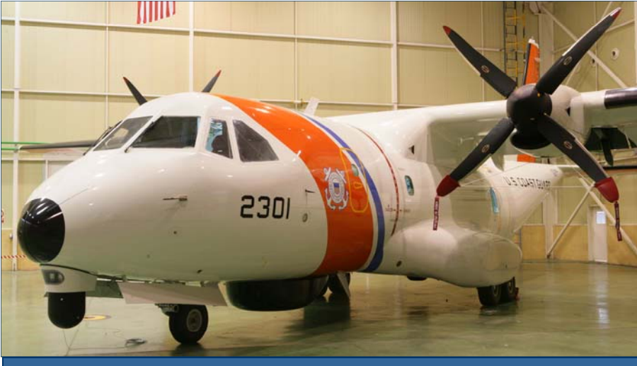
The first HC-235A medium-range surveillance maritime patrol aircraft was unveiled at the EADS CASA plant in Seville, Spain, on March 23.

plan for achieving enhanced maritime domain awareness," said Leo Mackay, president of ICGS. "Linked with other Deepwater surface, air and shore system assets through a common operating