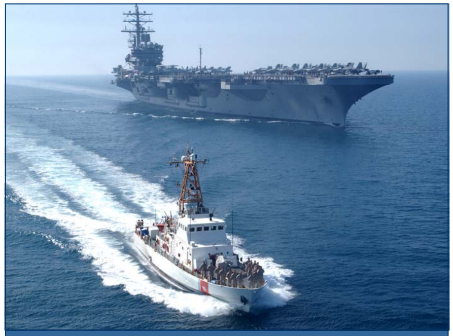
The Navy-Coast Guard National Fleet Policy provides for a full range of capabilities across the entire spectrum of maritime threats and missions. Here, the Coast Guard cutter WRANGELL (WPB-1332) is shown alongside the nuclear-powered aircraft carrier USS RONALD REAGAN (CVN-76) underway in the Persian Gulf in early March. CGC WRANGELL is one of the Coast Guard units currently supporting Operation Iraqi Freedom and other national-defense missions in the region as part of the U.S. Fifth Fleet's Patrol Forces Southwest Asia.

This approach is reflected in the Navy's Littoral Combat Ship program, for example, a highspeed, networked combatant with capabilities optimized to assure naval and joint force access into contested littoral regions. The