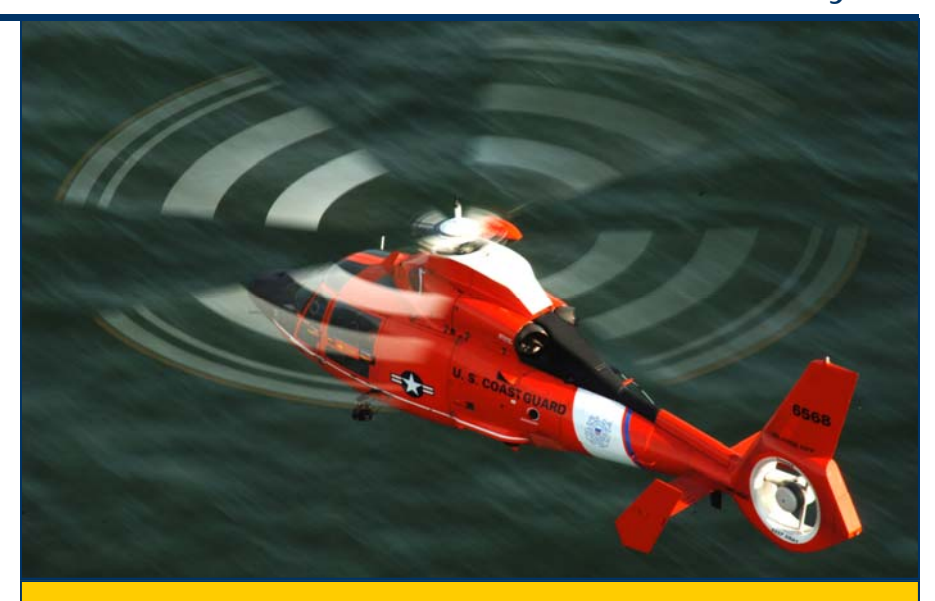
Coast Guard legacy aircraft and cutters, modernized by the Deepwater Program, are helping to make U.S. ports safer. This HH-65C helicopter, assigned to Coast Guard Air Station Atlantic City, N.J., flies low over the Atlantic Ocean in January. A total of 25 of the more powerful and capable HH-65Cs, re-engined and upgraded by the Deepwater Program, were delivered by the end of February.

gram necessarily invests in capabilities adequate to operate in the often-unforgiving offshore environment," he told Congress in early March, "it is these same capabilities that are instrumental to effective response operations in port and coastal areas as well."