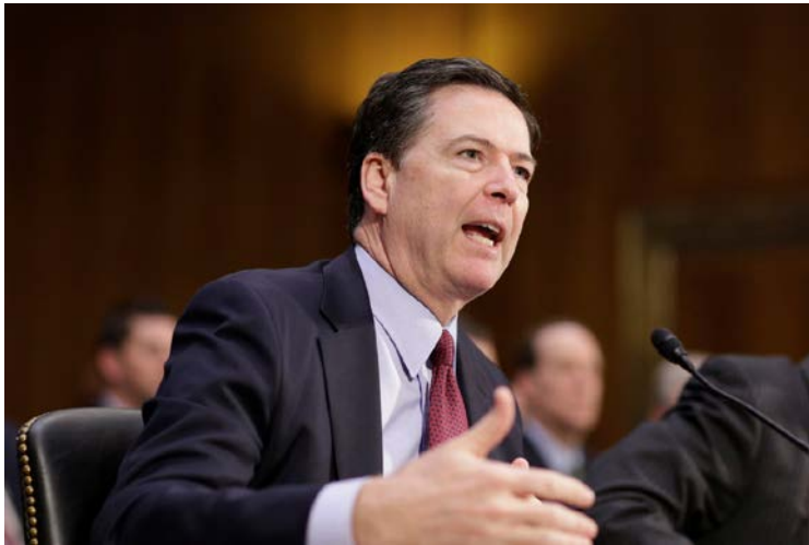
FBI Director James Comey before the Senate Select Committee on Intelligence on Tuesday.

Top lawmakers already have inquired publicly about the kinds of issues described in the memos. In a hearing Tuesday with four top intelligence officials, Sen. Ron Wyden (D., Ore.) asked FBI Director James Comey if the bureau had investigated whether individuals close to the Trump campaign have any links to Russians. Mr. Comey declined to answer, saying he couldn't confirm or deny if an investigation had begun.