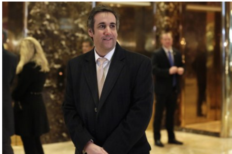
Michael Cohen, an attorney for President-elect Donald Trump.

"I have never been to Prague in my life. #fakenews," Cohen tweeted. He included a photo of his passport.