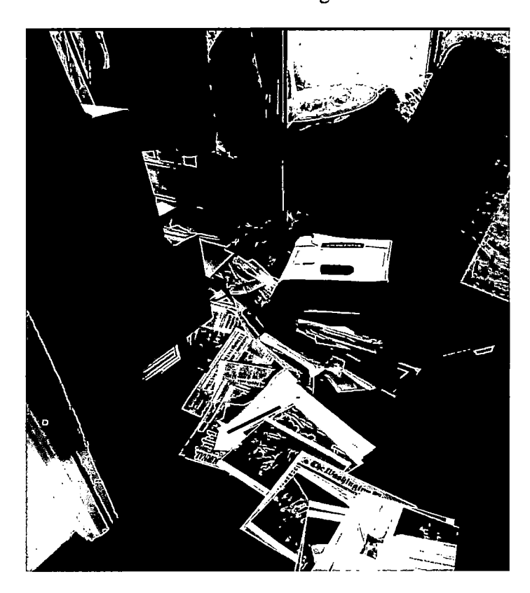
TRUMP's Disclosures of Classified Information in Private Meetings

TO USA, FVEY," which denoted that the information in the document was releasable only to the Five Eyes intelligence alliance consisting of Australia, Canada, New Zealand, the United Kingdom, and the United States. NAUTA texted Trump Employee 2, "I opened the door and found this..." NAUTA also attached two photographs he took of the spill. Trump Employee 2 replied, "Oh no oh no," and "I'm sorry potus had my phone." One of the photographs NAUTA texted to Trump Employee 2 is depicted below with the visible classified information redacted. TRUMP's unlawful retention of this document is charged in Count 8 of this Indictment.