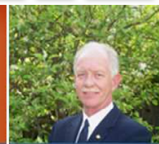
The heroic pilot who landed his plane on the Hudson River and saved the lives of 155 people. Chesley Sullenberger