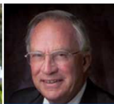
Former Director of the Central Intelligence Agency Porter Goss